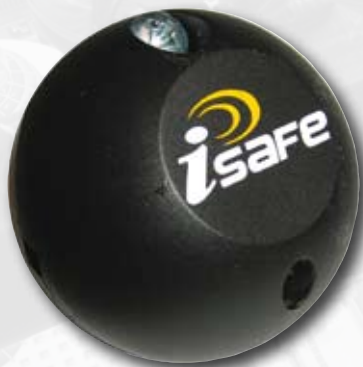
i-Safe™ Cable Retrofit Tag