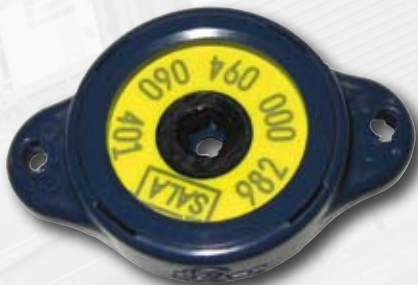
i-Safe™ Rigid Retrofit Tag