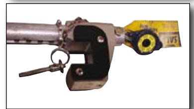
Rigid Retrofit Tag Installation