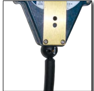
Cable Retrofit Tag Installation