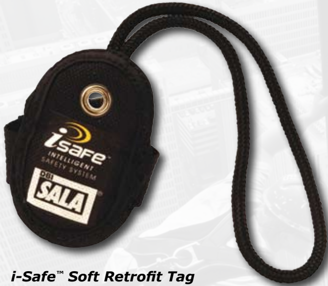
i-Safe™ Soft Retrofit Tag