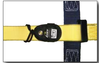
Soft Retrofit Tag Installation